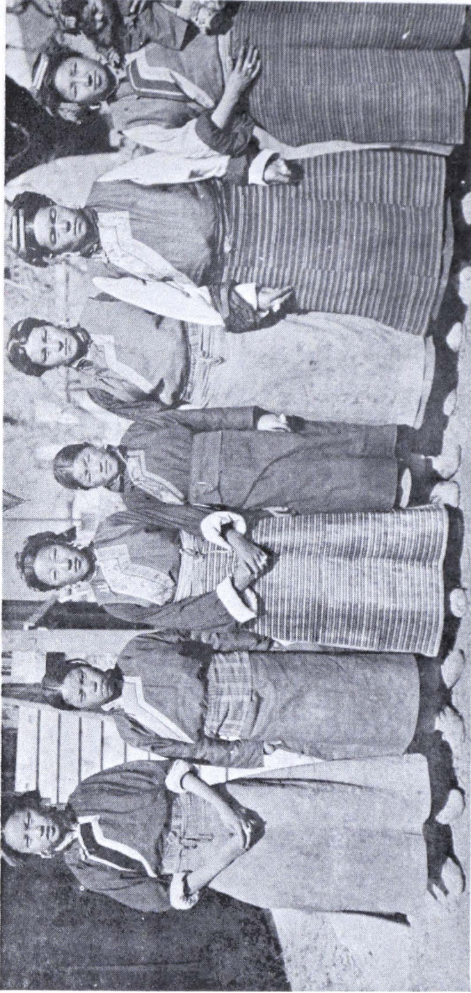
Tibetan women ranging from eighteen to forty years old dressed for a dance in the yard of our home. They will sing songs as they dance, songs as in Chapter IV.